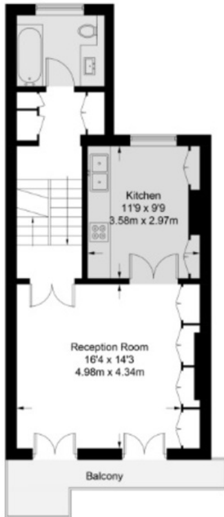
First Floor 520 sq ft / 48.3 sq m